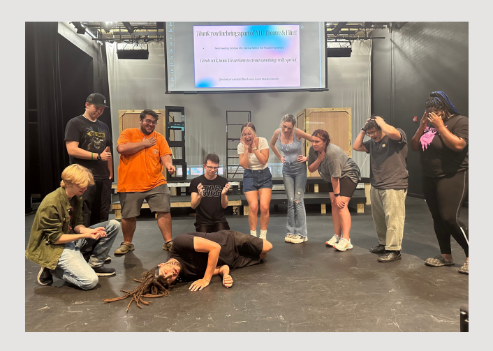
"one thing about theatre/film kids... they don't take normal pictures" - @atutheatreclub on Instagram